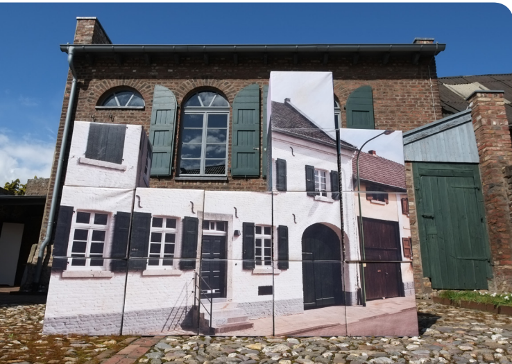
Block jigsaw from the museum's educational programme: front view of the synagogue Vorsteher's house