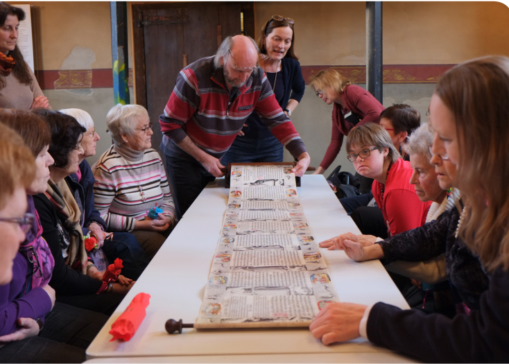
Purim workshop: an Esther scroll is unrolled and explained

Audio guides are available free of charge in German, English and easy German (for visitors with cognitive disabilities, as well as those with limited German). The media room contains a library, as well as facilities for viewing films on the life of Rhineland Jews, and on religious dietary rules.