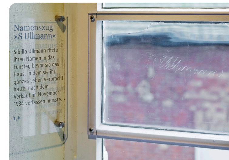
Sibilla Ullmann, daughter of the synagogue's founder, left her signature scratched into the glass of this window

Between 2006 and 2008 the LVR undertook careful restoration of all the Rödingen buildings. Many seemingly insignificant traces of former usage were retained or made visible again. In the synagogue itself, the Torah niche, women's gallery, and remnants of ornamental painting recall the building's former religious use. The aim of the restoration was not to create a replica of the building at any particular phase of its history, but to reveal its whole history from 1841 to the present. Hence traces of its later function as a workshop and storehouse have also been retained.